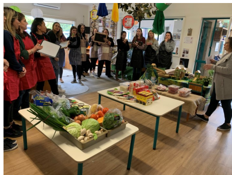
Our MasterChef Team Challenge!