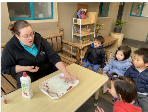
Kangas & Possums children learning how germs 'run away' when using soap to wash hands.

Helping children understand the importance of hygiene, health and wellbeing, through our educational program and intentional teaching as well as increasing their knowledge of pandemics.