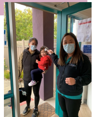
Ensuring staff are safe with PPE

Together we can help stop the spread and stay healthy!