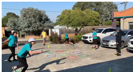
Staff fitness session with Coach Luke

Providing staff with policies, procedures , risk management plans and PPE that reassures them of the practices we have created to make them feel supported, valued and safe.